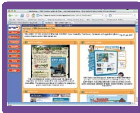
"The world of digital content" Class

possible, for example, by changing the look and feel and adding links to their favourite websites. The pupils have readily adopted the Learning Platform and the vast majority now log on a daily basis with ease. A large number also log on during out of school hours. Mr. Groves feels one of the main reasons that the pupils have adopted the Learning Platform with such ease is that many of them are visual learners and the Learning Platform has opened up to them areas that they previously found difficult to understand and be involved in.