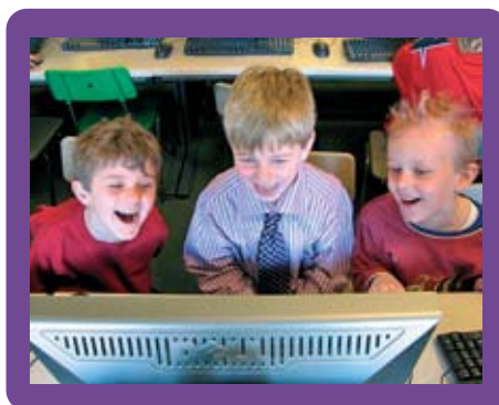
Pupils accessing work in class